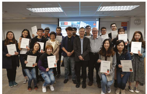
Swinburne Scholarship Presentation Ceremony