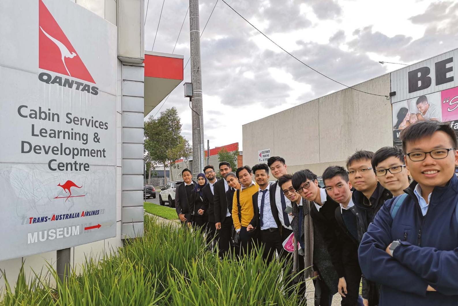
Visit to QANTAS Cabin Services Learning & Development Centre