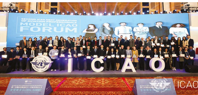
HKU SPACE aviation students are winning team member of the Outstanding Solutions for the Case Study in ICAO model forum