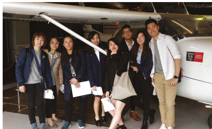
Flight Simulation Practice at Hawthorn Campus, Swinburne University of Technology

* A 'course' in the Hong Kong curriculum is equivalent to a 'unit' in the Australian curriculum.