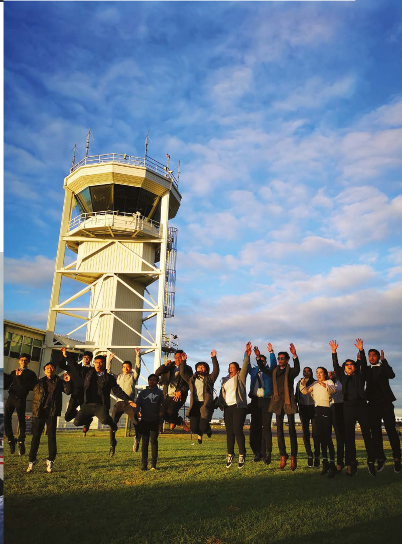
Highlights from Overseas Study Trips (Singapore and Australia)